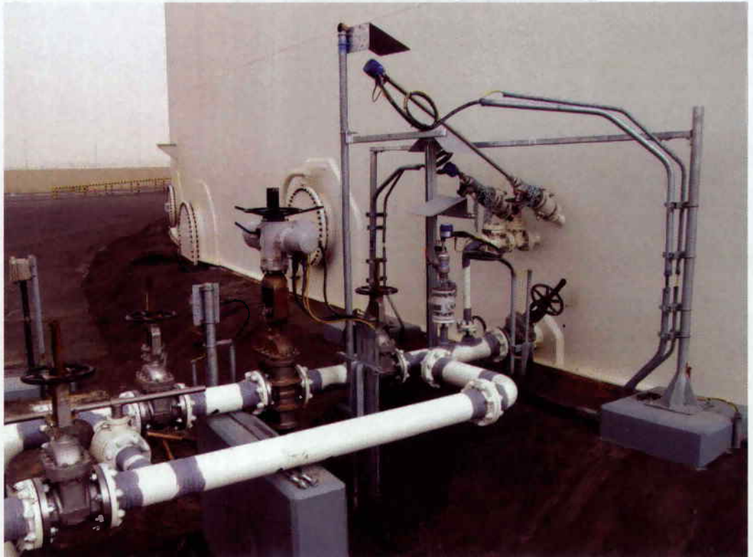
Tank dewatering in action

The technology also uses a second alarm probe, inserted lower into the water draw-off sump, 50cm below the control