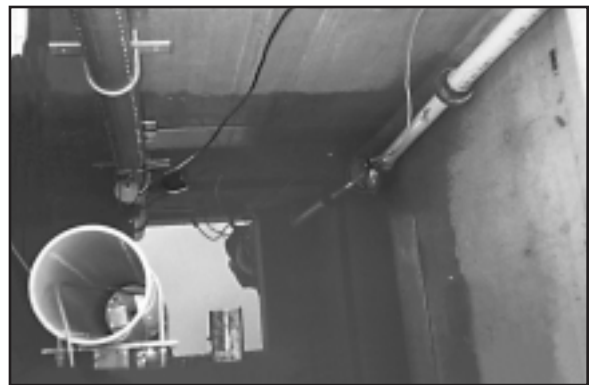
An ID-223 installed in a sump near a transformer substation.

In large cities, high voltage power cables are run underground. These cables are insulated with large quantities of oil, which is constantly pumped along the cable through underground pumps. Transformers are installed in building cellars and in underground vaults. The access to these cables and supporting equipment is through manholes. The underground cable service manholes can fill up with water and utility maintenance teams have to pump the water out into the drainage system. If oil is detected, the water has to be removed for treatment. Oil detection can be done either in a fixed installation of Leakwise ID-221 or ID-223 Detectors or by manually using a transportable ID-223 Oil Sheen Detector, that can be operated by 12 VDC from the service trucks.